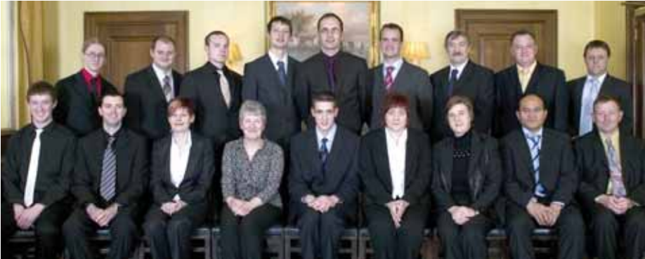
Prizewinners at the annual prize giving event 2008