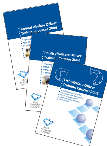
Livestock Welfare Courses – see page 4 for the remaining programme of courses during 2008

We always get great feedback from attendees, so make sure you too are up to date and book your place.