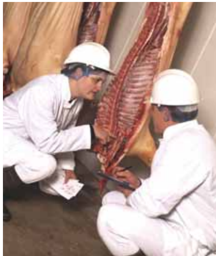
Candidates in action during first Accelerated Management Development Programme